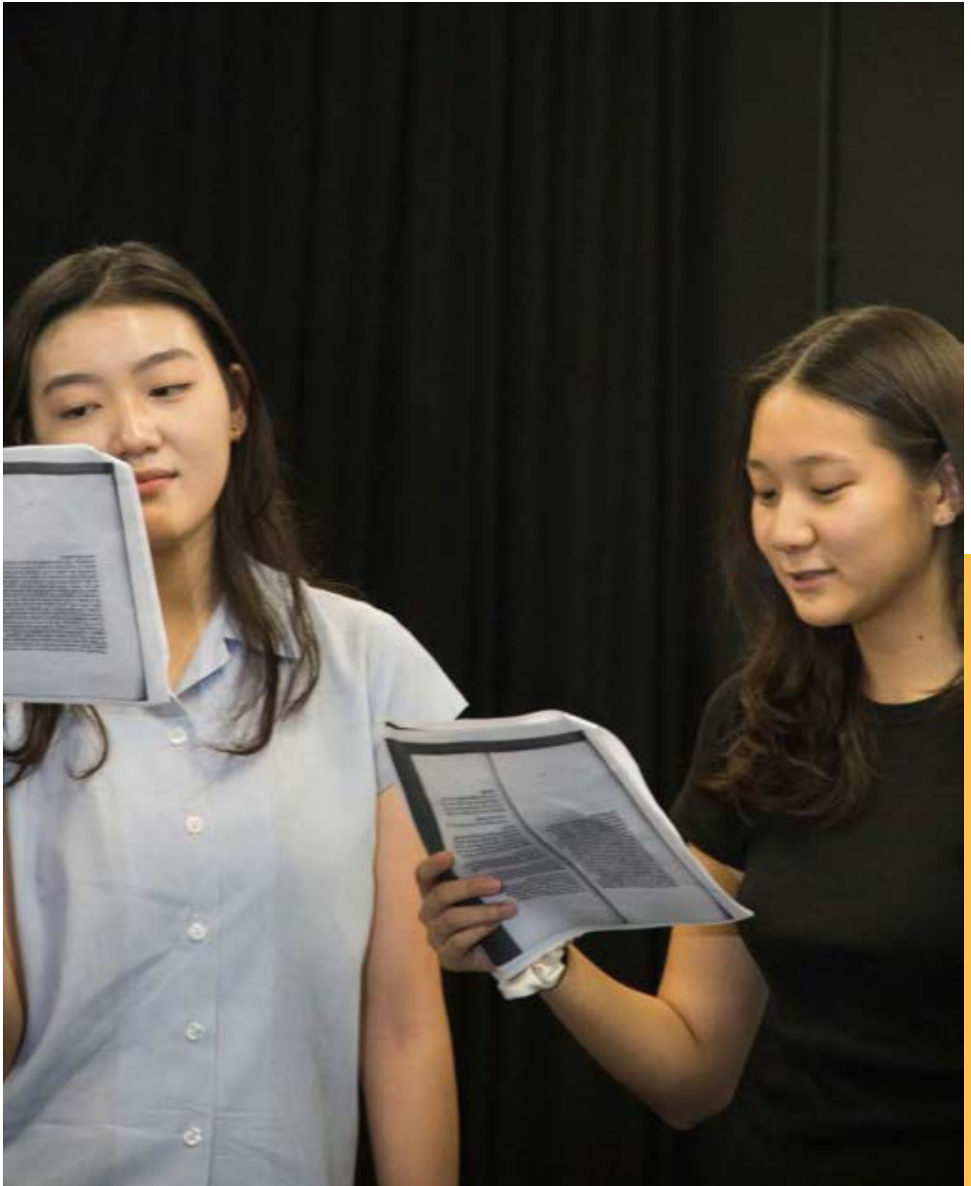
Above: Students rehearsing for their performance.