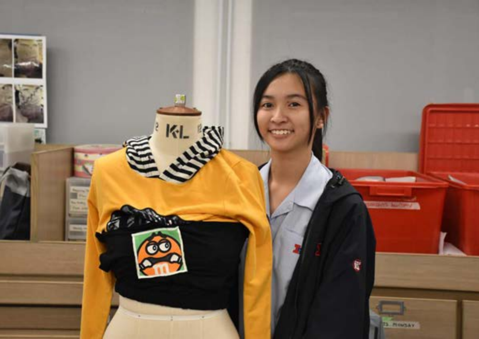
Above: Student in Fashion Forward Elements.