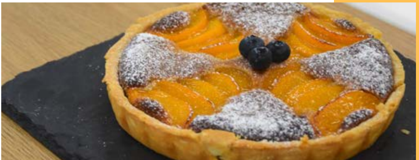
Above: Desserts made by students.